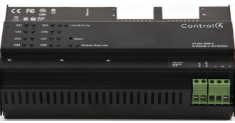
Figure 1. Wiring in Control4 Panel