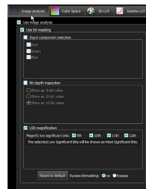
Input analysis mode with bit depth analysis