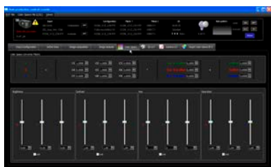
Easily adjustable color space settings (YCbCr to RGB conversion matrix)

Increased control over the projection parameters, such as look-up tables and color space settings, allows you to do your job with maximum accuracy. Supporting all cinema 3D modes, color correction per eye is enabled for 3D content.