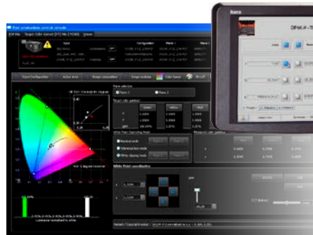
Look and feel adapted to dark environments